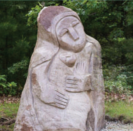
Nashua Symposium—Nashua, NH