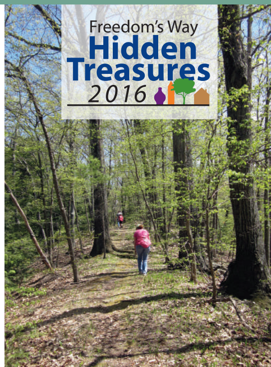
Beaver Brook Valley Preserve—Boxborough, MA

Cover: Museum of Russian Icons—Clinton, Zoetrope—Arlington Historical Society, Concord Museum, Chapel Museum—Amherst, NH, Historical Photo of Fitchburg Boulder, Wood Park—Hudson. Page two: Concord Museum, J.C. Ayer, Jason Russell House—Arlington.