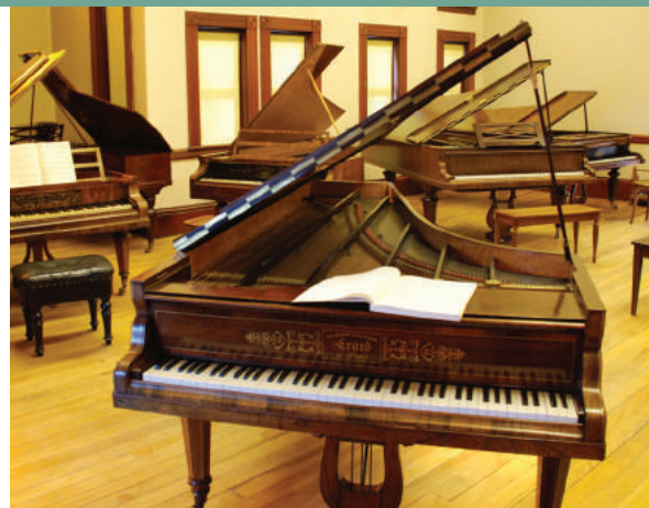
Ashburnham piano—Ashburnham, MA

Discover Boxborough's Esker at the Beaver Brook Valley Preserve Reservations Required by May 12