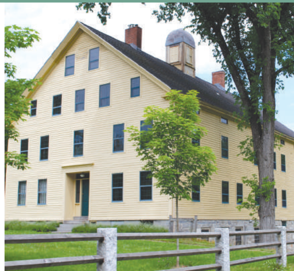
Shaker Village—Harvard, MA