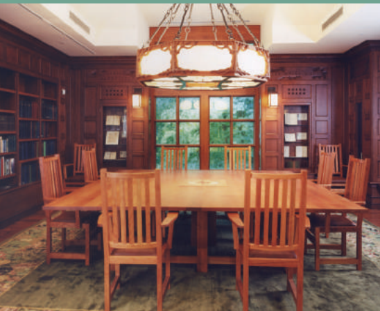
Thoreau Library, Walden Woods Project— Lincoln, MA