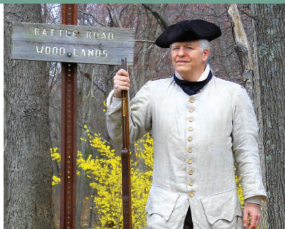
Road to Revolution—Woburn, MA

Meet at Abbot School 25 Depot St., Westford, MA The Westford Historical Society and Museum